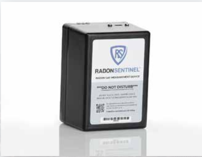
Radon Sentinel Measurement System