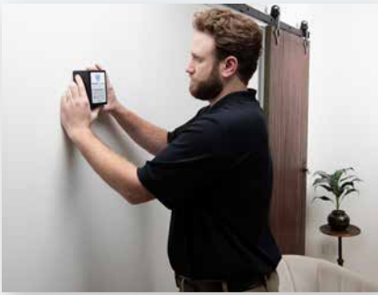
Radon Testing, Mitigation, & Monitoring