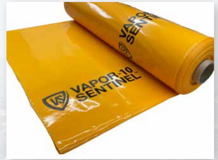
Vapor Sentinel New Construction