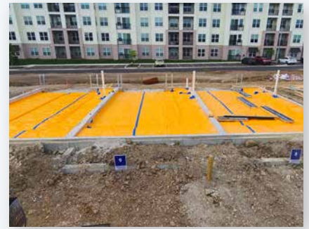
New Construction Design, Installation, & Oversight