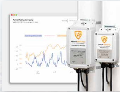
Vapor Sentinel Remote Monitoring